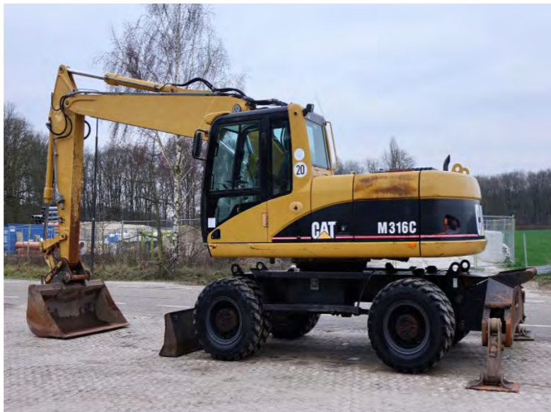
CAT M316-C W TYRES